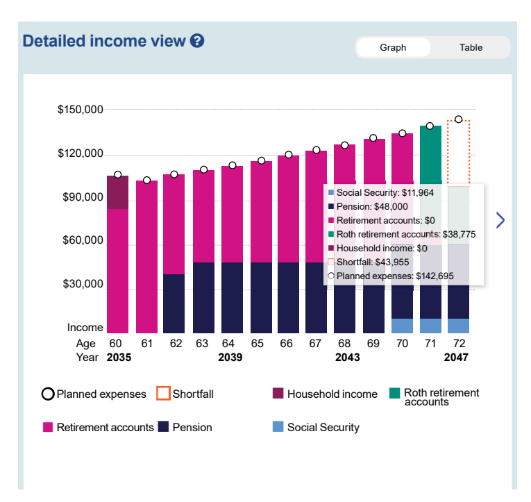
Figure 1. My Interactive Retirement Planner Detailed Income View

To learn more about the new enhancements MIRP has to offer, log into your account on savingsplusnow.com.